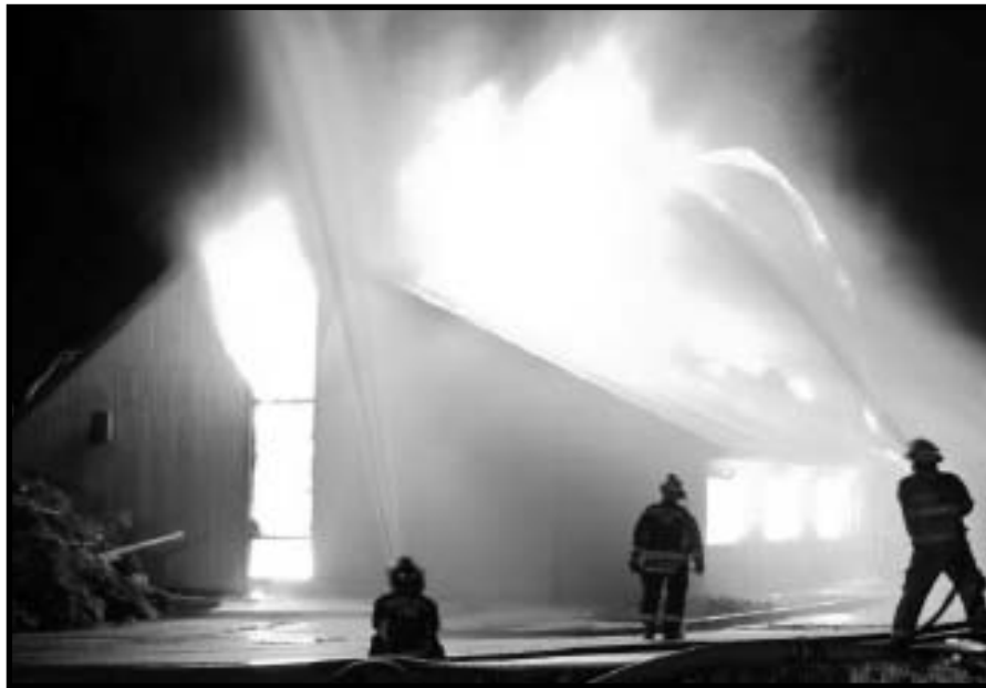
North Bend Fire and Rescue "Burn to Learn" the Pizza Hut building on October 18, 2011

Simpson Park and Ferry Road Parks are starting to fill up for next year. Please call 541-756-2656 if you have questions or would like to make a reservation. Remember that at all parks, pets must be leashed and their waste picked up.