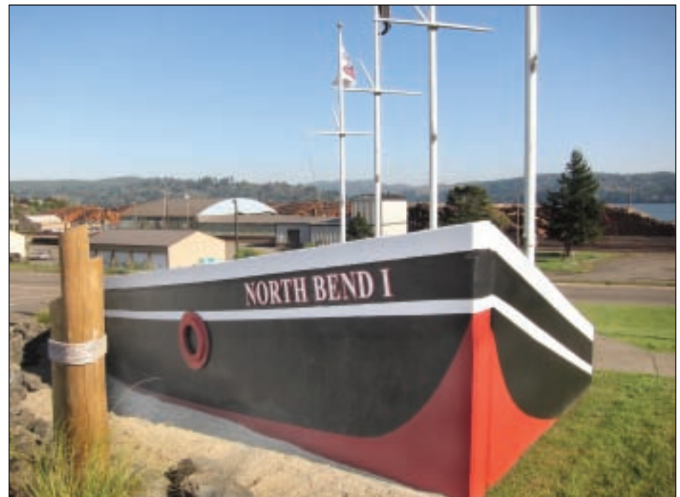
North Bend I on the North Flag Island along Hwy 101 is already a popular location for photo opportunities.